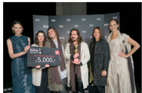
WINNER 2016: ROEE (AT)