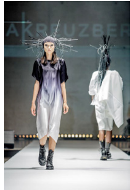
OPENING FASHION SHOW 2016

HOSTED BY: GERALD VOTAVA MUSIC: RAINER BINDER-KRIEGLSTEIN VISUALS: OCHORESOTTO HAIR: DOPELHOFFER & STEININGER - HAIR COUTURE MAKE-UP: IQ BEAUTY