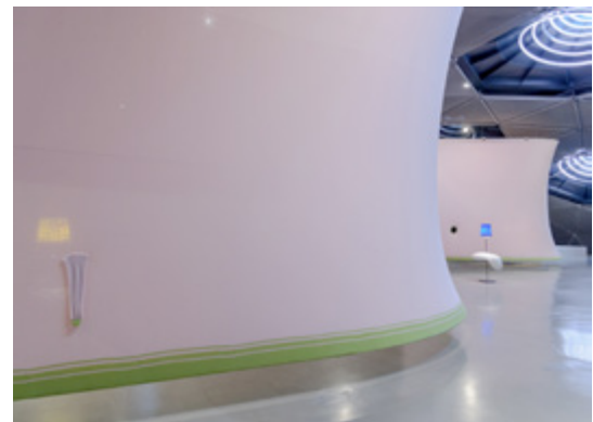
ERWIN WURM: WELTRAUMSCHWITZER